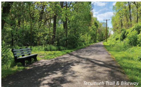
Tecumseh Trail & Bikeway