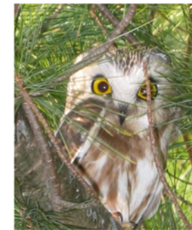
Saw-whet owl at Killdeer Plains