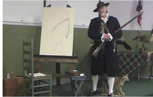
John James Audubon Program

Whatever your interest in birds, the Darke County Birders has a program for you!